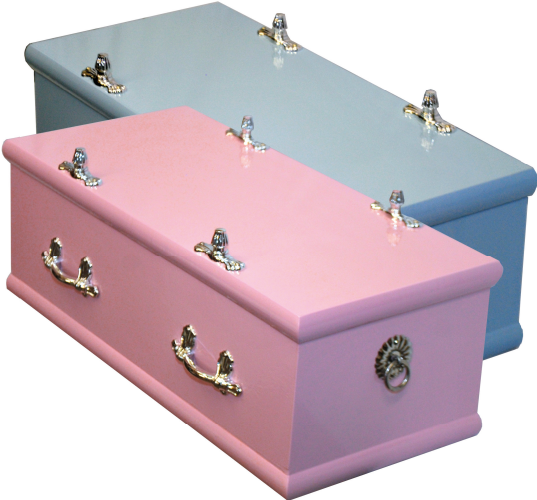
Coloured Casket - £120