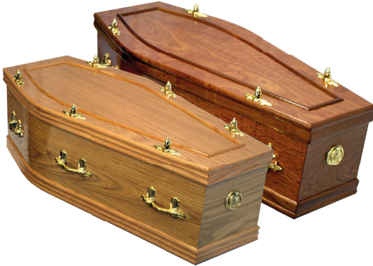
Classic Coffin £225