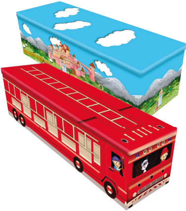
Colourful Coffin £420

Please Note: This is a specifically designed coffin which takes three working days to be delivered following approval of the final proof by the family.