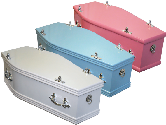
Classic Coloured Coffin £145