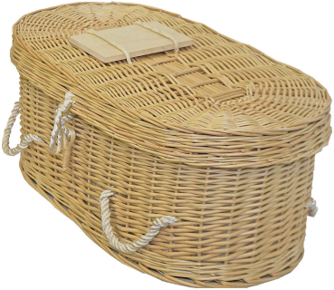
Natural Coffin £240