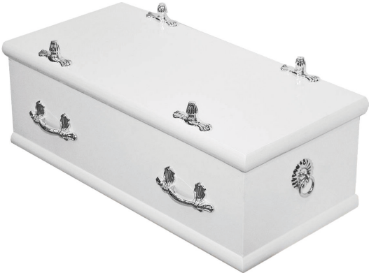
Traditional White Casket - Free of Charge